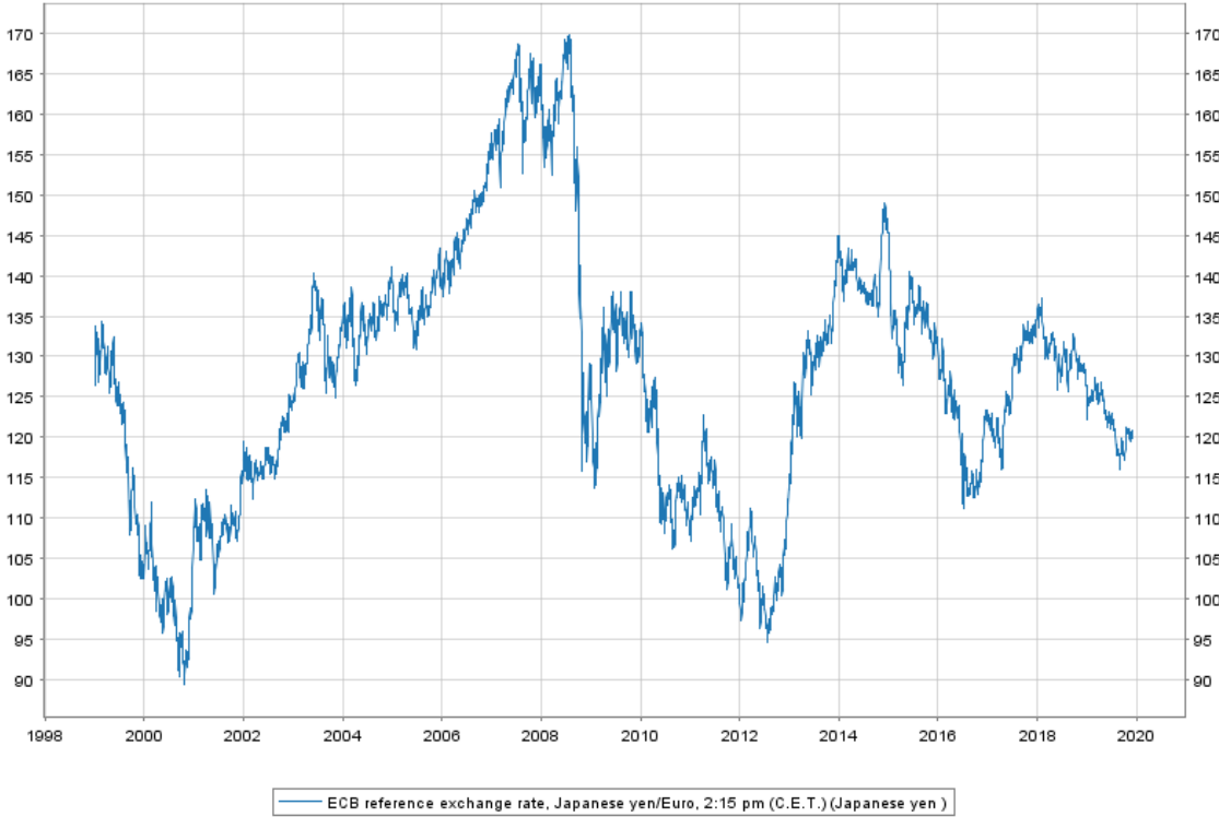
Figure 2: Daily Data on the Euro-Yen Exchange Rate