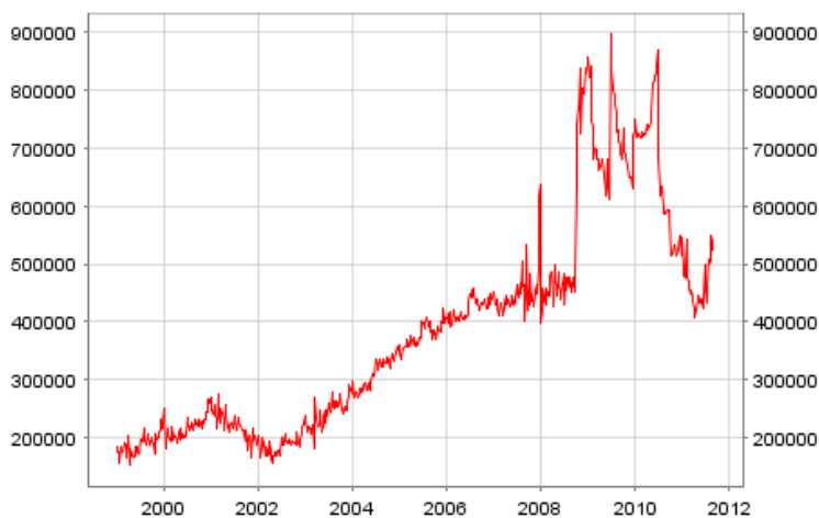
Figure 3: ECB's Lending From Monetary Policy Operations (in millions of euros)

Perhaps more important than the rate cuts was the willingness of the ECB to be flexible in its operational procedures. The Bank moved from auctioning off fixed amounts of credit to fixed rate tenders in which banks could borrow as much as they wished, provided they had sufficient eligible collateral. Rules in relation to collateral were also eased. The result was a rapid increase in ECB lending, with the ECB stepping in to provide necessary liquidity as interbank markets seized up. While these measures did not avoid a severe recession, they undoubtedly helped to limit the size of the dip in activity and have helped to coax the Euro area economy out of recession. For these decisions, Trichet deserves significant credit.